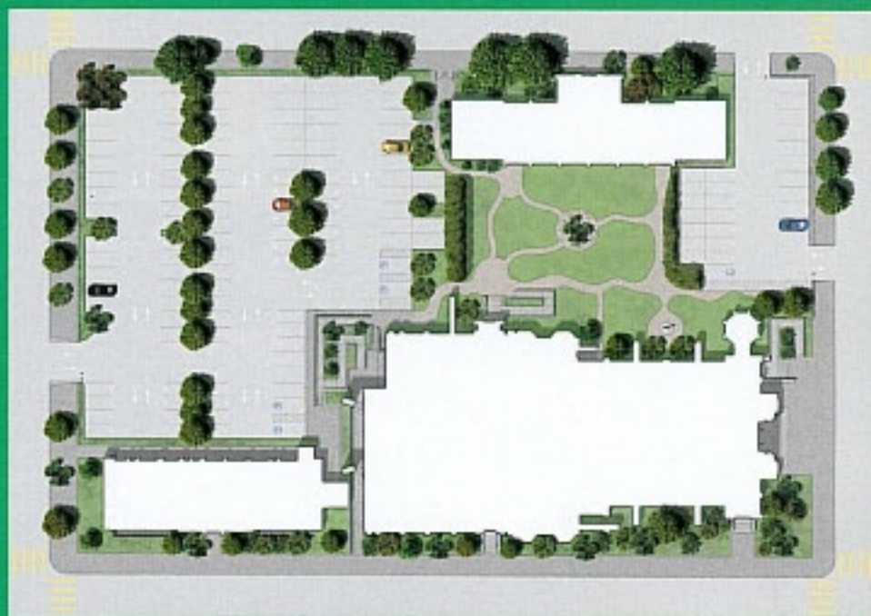
Drawing for St. Dominic's Site Plan. Rendering by Carver + Schickentanz