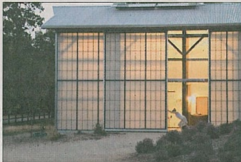
Left: A completed project called Duxbury Barn. Below: an interior shot of that new home.

Most recently, the house won the Silver Award for a residence under 3,500 square feet in the Green Home Project of the Year category of the Dream Home Awards ( www.dreamhomeawards.com ) annual competition open to